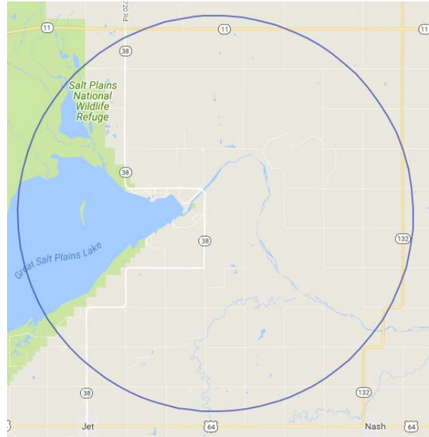
5 mile radius around Kegelman